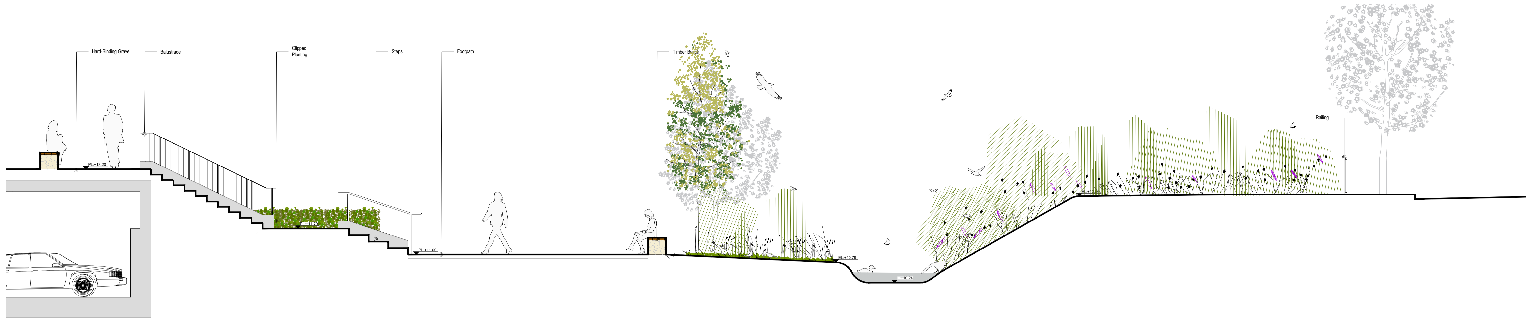
C-C Podium / Public Park Stepped Access Scale 1:50

Copyright : All creative artwork, landscape symbology, text, legends, specifications, descriptions and illustrations used in our drawings and reports are the intellectual property of ait urbanism + landscape ltd. and are not to be reproduced by others.